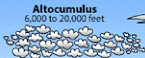
Altostratus 6,000 to 20,000 feet