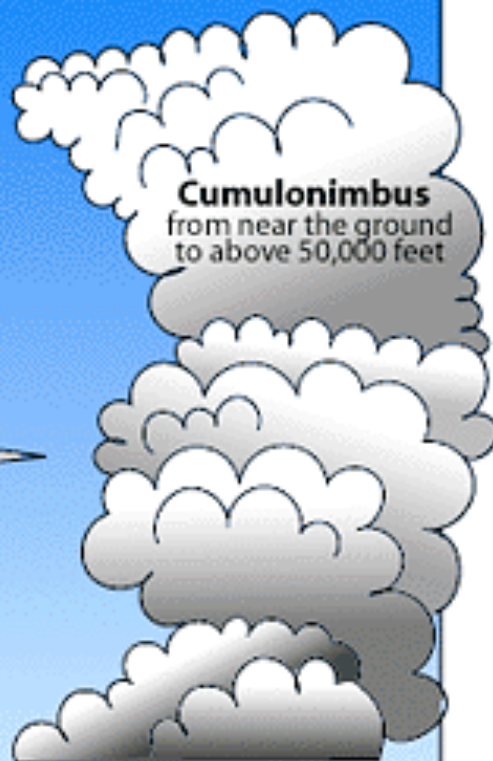
Cumulonimbus from near the ground to above 50,000 feet