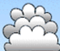
Cumulus below 6,000 feet